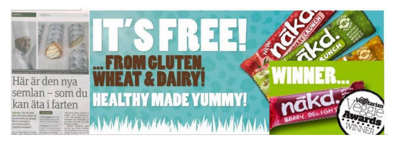
Figure 2. Illustration of current trends relating to food on the go, green issues, health and naturalness.