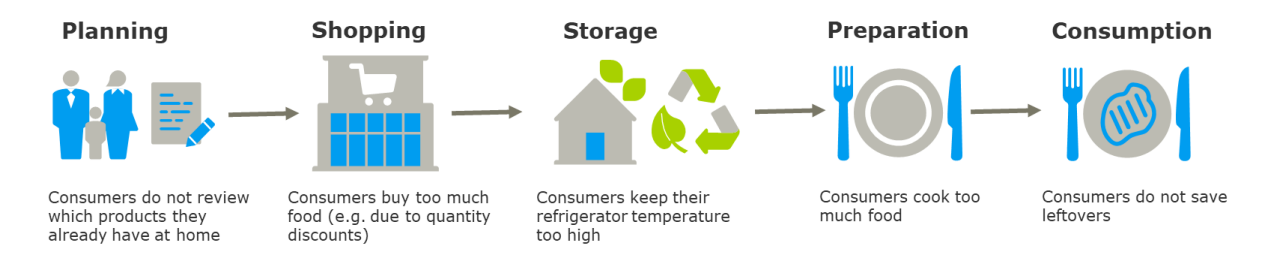
Fig. 1. Household food waste arises in several phases

Food waste can arise when consumers purchase food without planning what they will buy, and thus purchase more than necessary, or purchase items they will later fail to eat. A lack of time, and the emergence of unforeseen circumstances, have both been shown to affect how much food is unnecessarily thrown away.