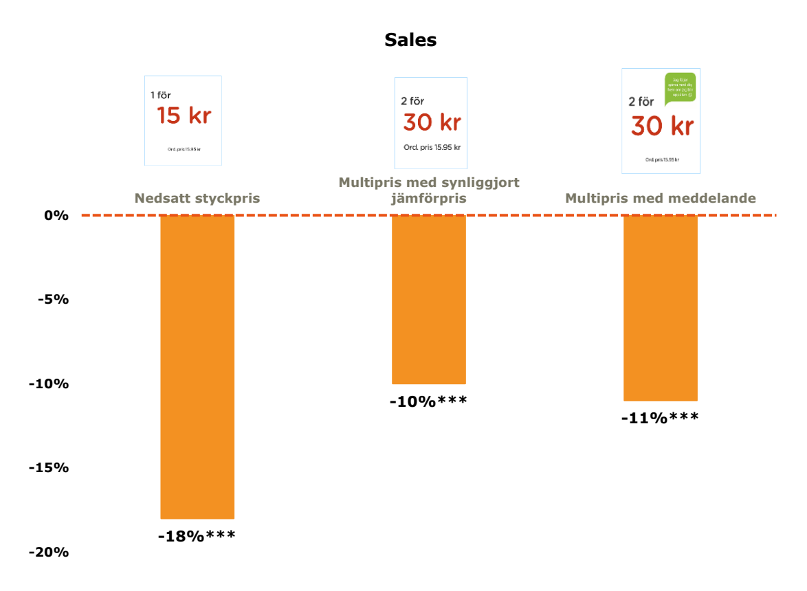
Figure 4 Sales compared with quantity discount

Not: n=140. Robust standard error, *** p<0.01, ** p<0.05 and *p<0.1.