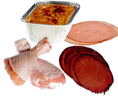
Hilib iyo faliqyo hilib ah darey ama la barafeeyey