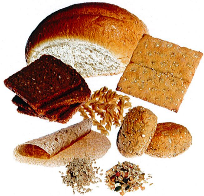
Rootiga iyo waxyaabaha hadhuudhka (badarka) ka sameysan sarreen, baasto, bariis iyo waxyaabaha lagu quraacdo