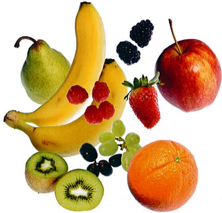
Khudrad iyo midho darey ama la barafeeyey