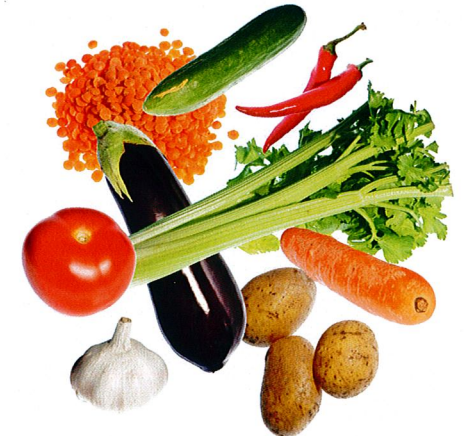
Khudrad iyo baradho darey ama la barafeeyey