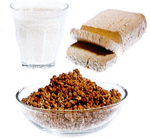
Waxyaabaha khudrada laga sameeyo caanaha soya lag sameeyey. sarreenka la cabo, toofuuda (tofu) iyo khudrada bedel looga dhigto hilibka iyo kalluunka/malaayga