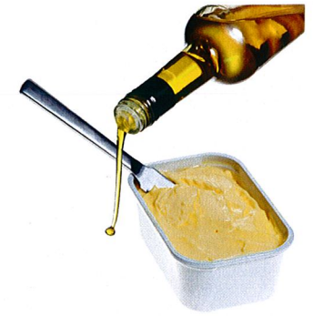
Saliid subag (margarin)