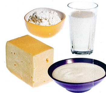
Wayaabaha caanaha laga sameeyo: caano, ciir (yoghurt), jiis/ farmaajada