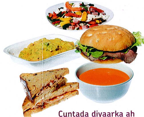
Cuntada diyaarka ah maraq, biisa, raashin isku jir ah, rooti wax ku dhex jiraan