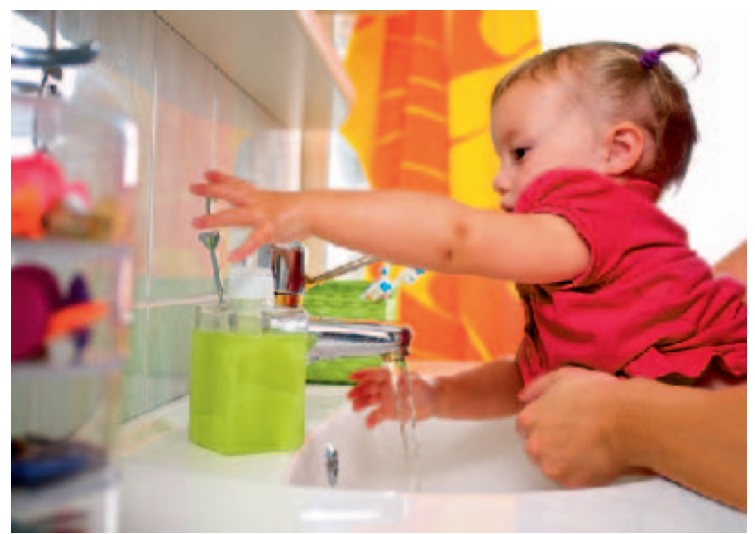
Good hygiene is important when cooking food with and for children.