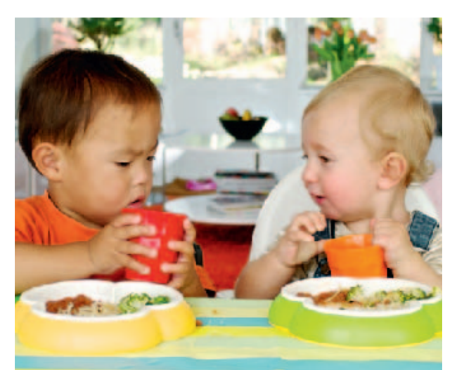
Do you want to know more? Visit www.livsmedelsverket.se There is more information on food for children, and much more.