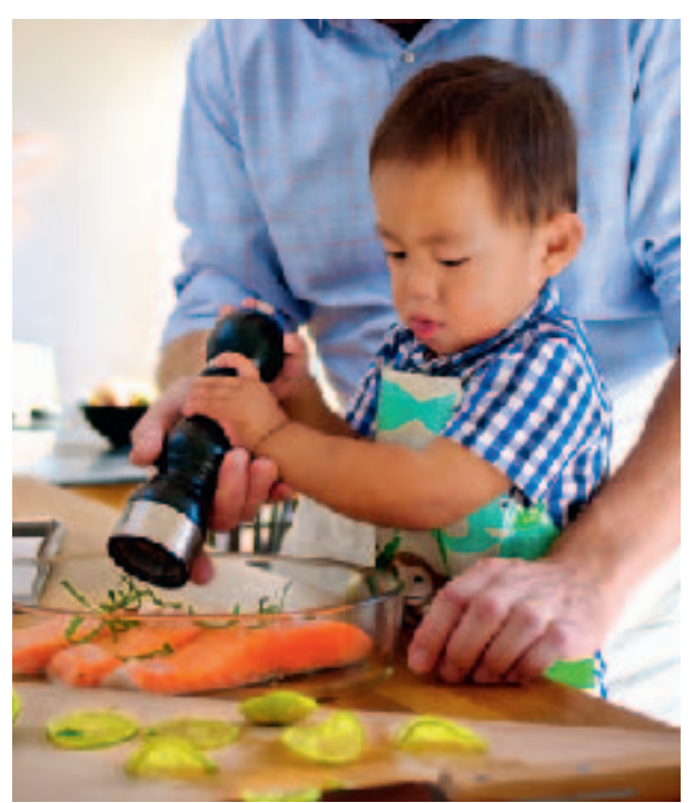
It's good for children to eat fish, preferably 2-3 times a week.

Iron is a nutrient that can be difficult for small children to get enough of. Iron-enriched porridge or gruel is therefore good, even during your child's second year of life. Meat, blood pudding, blood bread, and other blood dishes are also rich in iron. Beans, chickpeas, lentils, tofu, and a range of nuts and seeds are vegetarian sources.