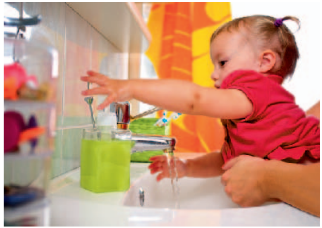
Good hygiene is important when cooking food with and for children.