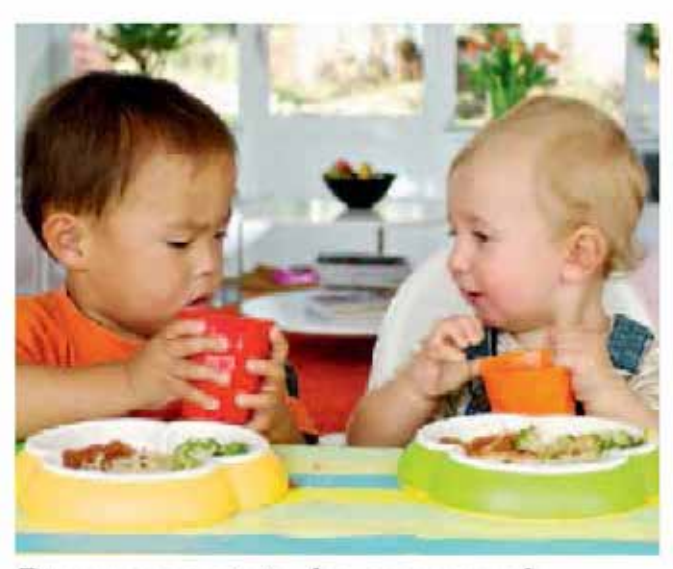
Do you want to know more? Visit www.livsmedelsverket.se There is more information on food for children, and much more.