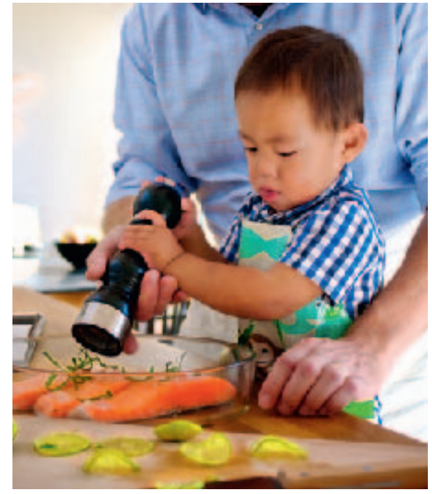
It's good for children to eat fish, preferably 2-3 times a week.

Iron is a nutrient that can be difficult for small children to get enough of. Iron-enriched porridge or gruel is therefore good, even during your child's second year of life. Meat, blood pudding, blood bread, and other blood dishes are also rich in iron. Beans, chickpeas, lentils, tofu, and a range of nuts and seeds are vegetarian sources.